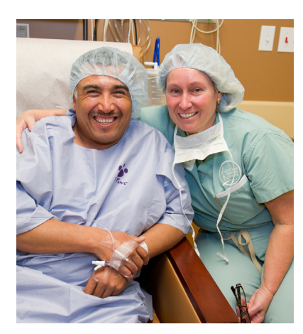
Medical volunteers donate their time to help PASD patients get well and back on their feet.

Patients surveyed also reported their use of hospitals stays during the six months prio to their Project Access enrollment and after they received care; Project Access demonstrated a 94% reduction in inpatient days and hospital costs for uninsured community residents.