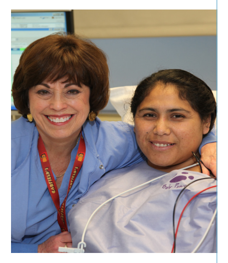
Medical professionals volunteer their services to provide donated care for the uninsured.

PASD's work benefits the populations we serve: patients, clinics, and volunteer physicians, as well as the healthcare system and other healthcare organizations countywide. Here is how we benefit our community: