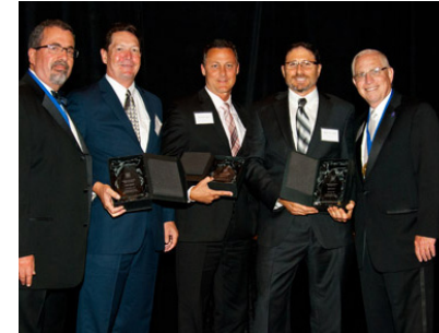
Members of the SurgeryOne/ASMG team received award at the 2013 White Coat Gala